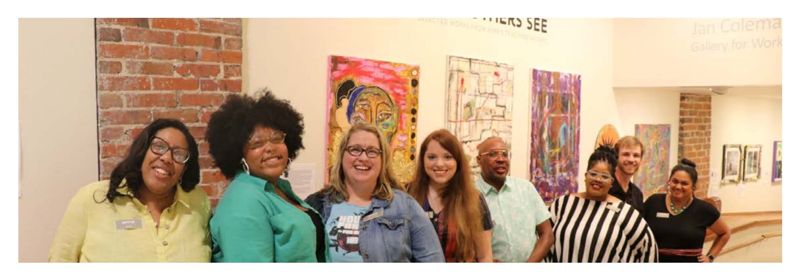
WMA cares for objects held in the public trust, and preserves art for future generations to enjoy. With the art and artists of our time at the forefront of our work, WMA is the vibrant undercurrent of Dothan's creative ecosystem.